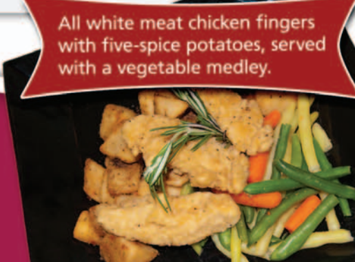
All white meat chicken fingers with five-spice potatoes, served with a vegetable medley.

Meals weigh from 480g to 510g. Meals will be delivered frozen. Cash, VISA and Mastercard accepted. GST is extra. Some restrictions apply.