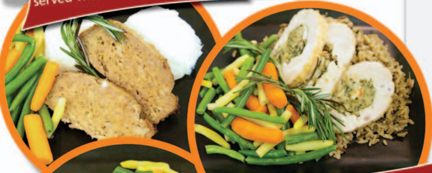
Meatloaf with mashed potatoes, served with a vegetable medley.