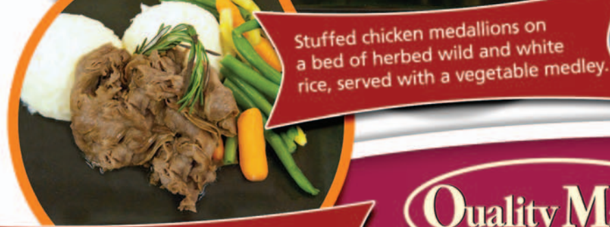
Stuffed chicken medallions on a bed of herbed wild and white rice, served with a vegetable medley.