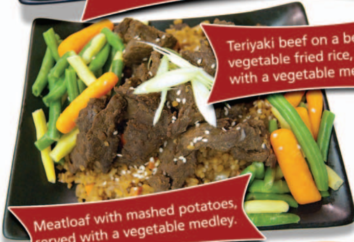
Teriyaki beef on a bed of vegetable fried rice, served with a vegetable medley.

Prices and quantities are subject to change. Some items may not appear exactly as illustrated.