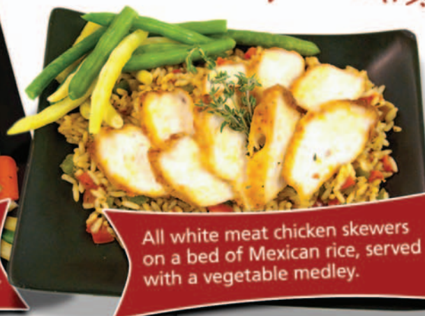
All white meat chicken skewers on a bed of Mexican rice, served with a vegetable medley.