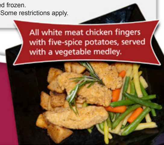
All white meat chicken fingers with five-spice potatoes, served with a vegetable medley.

Meals weigh from 480g to 510g. Meals will be delivered frozen. Cash, VISA and Mastercard accepted. GST is extra. Some restrictions apply.