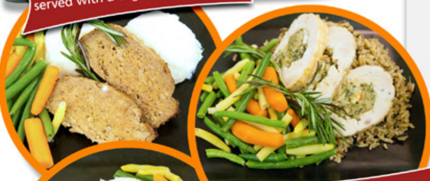
Stuffed chicken medallions on a bed of herbed wild and white rice, served with a vegetable medley.