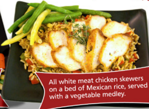
All white meat chicken skewers on a bed of Mexican rice, served with a vegetable medley.