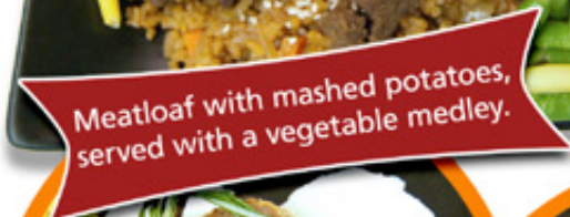
Meatloaf with mashed potatoes, served with a vegetable medley.