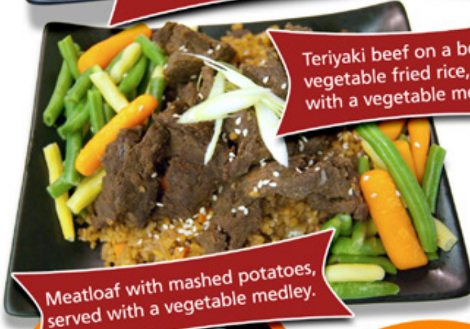
Teriyaki beef on a bed of vegetable fried rice, served with a vegetable medley.

Prices and quantities are subject to change. Some items may not appear exactly as illustrated.