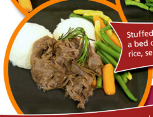
Roast beef with mashed potatoes and jus, served with a vegetable medley.