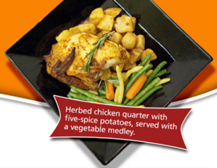
Herbed chicken quarter with five-spice potatoes, served with a vegetable medley.

Prepared fresh! with only the finest ingredients!